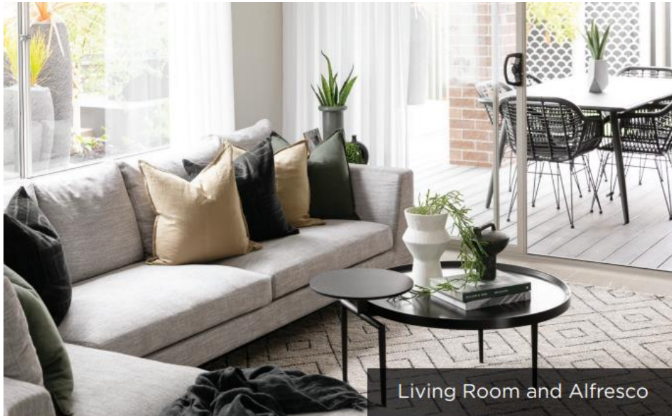
Living Room and Alfresco

Great Alfresco area for outdoor entertaining. Separate Theatre/games room for lots of family memories.